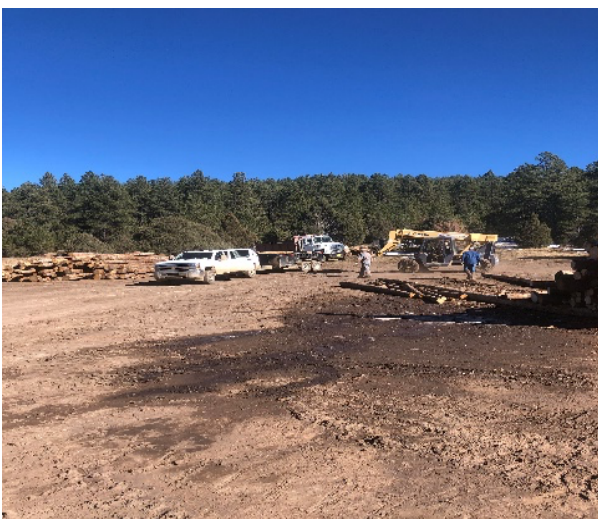
Fuelwood from the HP/CC fire lines at the Taos County yard in Rodarte

During the Calf Canyon and Hermits Peak Forest fire, the Carson National Forest closed the forest during the most important period for firewood gathering season. In May 2022, the Santa Bárbara and Las Trampas Land Grant Board members started working with several agencies to get firewood to our communities. We worked hard to get Carson National Forest management to reopen firewood allotment areas in Las Trampas, Ojo Sarco and Ojito. We also worked with the New Mexico State Land Office to keep the Copper Mountain firewood allotment open.